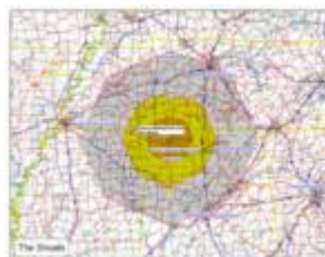
Airports In/Near The Shoals