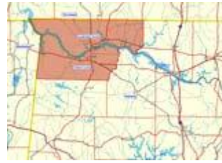
The Shoals Map