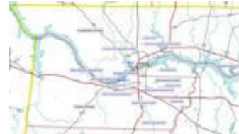
The Shoals--Industrial Parks & Sites