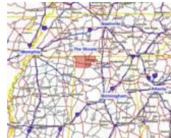
The Shoals—Regional Map