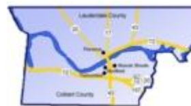
The Shoals—Highways 2