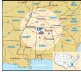
The Shoals—Regional Map