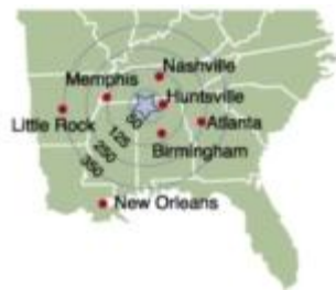
The Shoals and Regional Cities